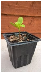
Mine (left) (oh dear!)