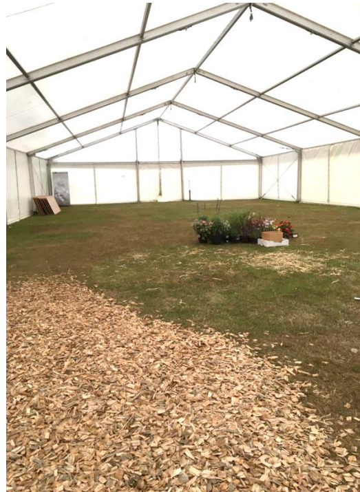
The marquee after the event!

Every year there are two or three competitions for WIs to enter. Our large marquee has a different theme each year and the competitions reflect this. The entries form a large display, showcasing members' talents and each Sub-Committee has a stand publicising the work they do and what is on offer. We also provide hospitality – the famous WI tea and cake! Everyone involved is busy with preparations in the week before and it is an extremely demanding but fun two days meeting members and the public.