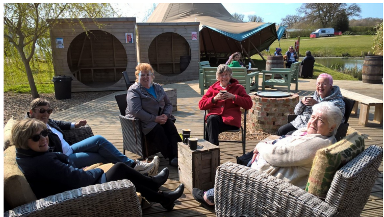
Coffee at Old Buckenham Country Park on 21 April - just lovely to see everyone again.

Plus great prizes for the runners up. Full details are in April's edition of WI Life. Tickets are available from Ann Kirkness and will be on sale at our meetings