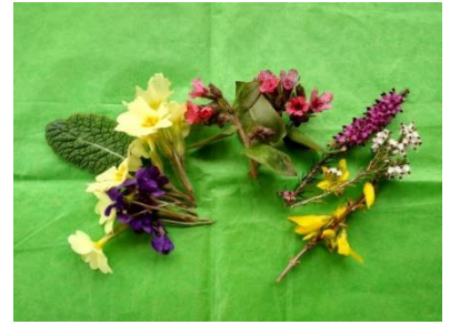
Gather your flowers

First blow your eggs. There are plenty of guides online. I used the BBC Good Food Guide . Then make scrambled eggs for lunch!