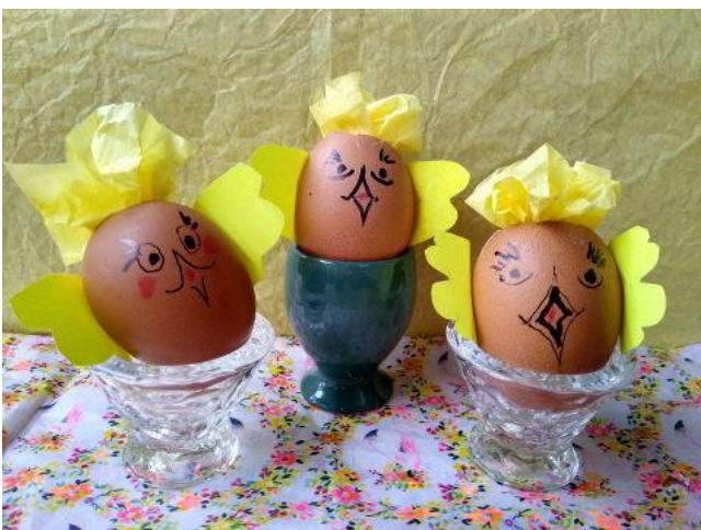
The finished chicks

Keep it simple Cut a thin strip of tissue paper to scrunch up. Pop it in the hole at the top. Yellow wool would do just as well.