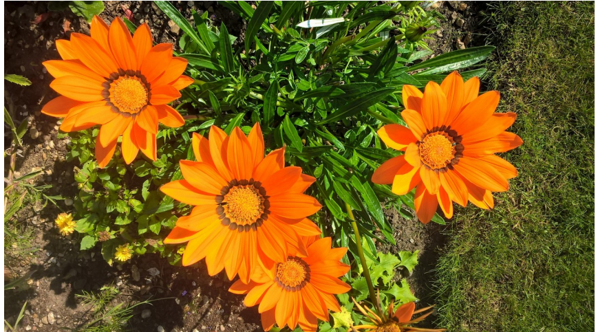
My bright gazanias in the lovely sun yesterday!

"Can you imagine a world without men? No crime and lots of happy fat women." — Nicole Hollander