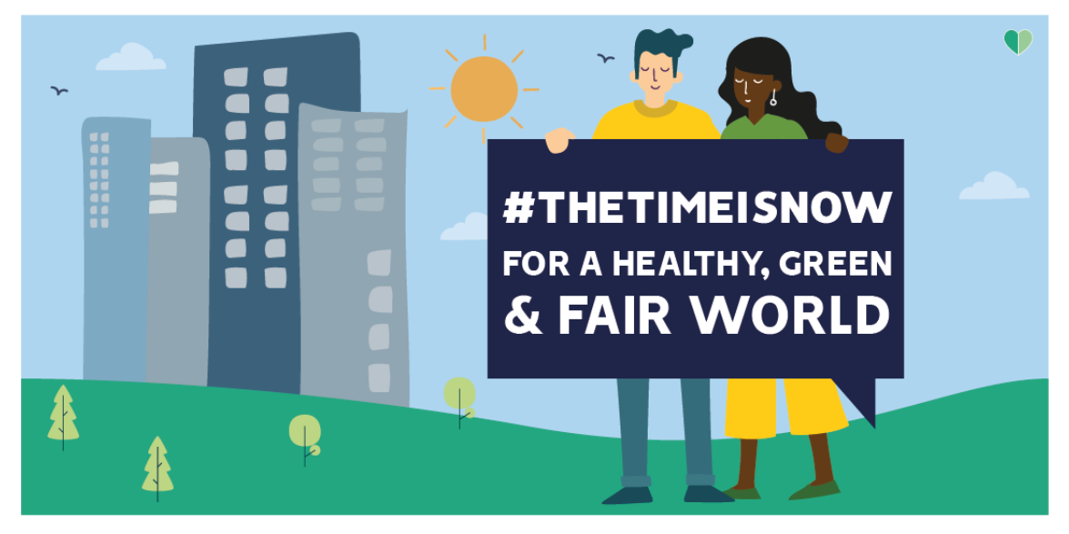
The First Ever Virtual Lobby for Climate Change!

In conjunction with The Climate Coalition, the NFWI have invited all members to be part of the <u>first ever virtual parliamentary lobby for climate, nature and</u> <u>people</u> on Tuesday 30<sup>th</sup> June .